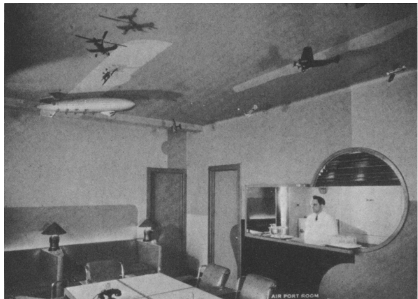
The Air Port Room, Hotel Sherman, Chicago

No trip to Chicago would be complete without a visit to the Chicago Zoological Park, popularly known as Brookfield Zoo. Wild animals wander about in cageless freedom in surroundings duplicating their native habitats. Wide moats rather than iron bars safely separate them