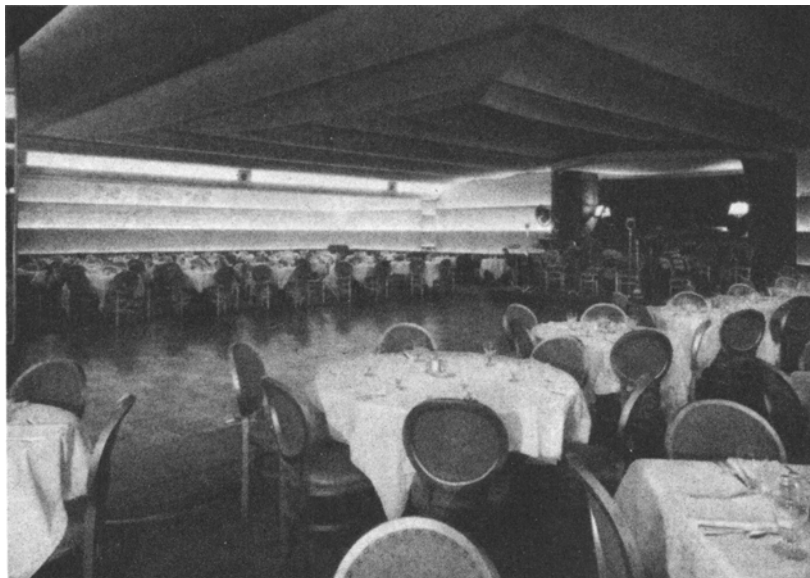
A view in the College Inn, Hotel Sherman, Chicago

Having gotten his bearings, the visitor is ready for detailed exploration into the city's wonders. No better start could be made than with the famed triumvirate at the south end of Grant Park on the lake front—the Adler Planetarium, Field Museum and the Shedd Aquarium. The planetarium, first in the United States, unfolds the mysteries of the universe, reproducing the skies with scientific exactitude to illustrate the movements of heavenly bodies through space. The Field Museum,